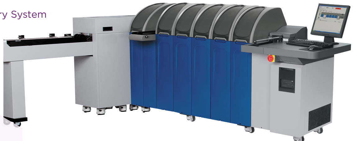
MXD210 Card Delivery System

Print-on-demand: Leverage black and white printing inline, feeding pre-printed sheets into the system.