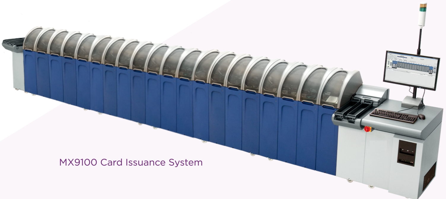
MX9100 Card Issuance System

Service and support: The MX Series Platform is supported by the industry's largest service and support network, which spans more than 150 countries worldwide. Online and phone support is available 24/7.